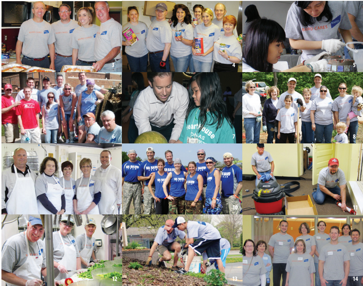
3) Baltimore 4) Akron 5) China 6) Cincinnati 7) Dallas 8) Davenport 9) Fox Valley 10) Fort Worth 11-12) Grand Rapids 13) Green Bay 14) Milwaukee